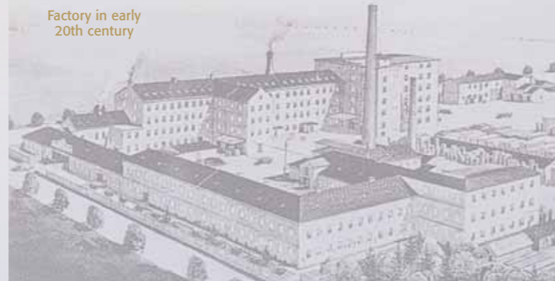
Factory in early 20th century